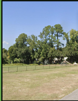
A view from the street.

With doing this project we gained a deeper knowledge of working alongside others and the community to improve the needs of the Brunswick community.